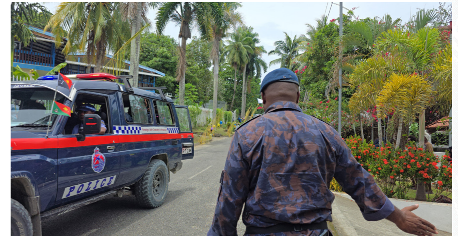
Police personnel managing traffic outside New Ireland Provincial Legislative Council Building

The Prime Minister also acknowledged that major trucking companies like Mapai and Trans Wonderland Ltd