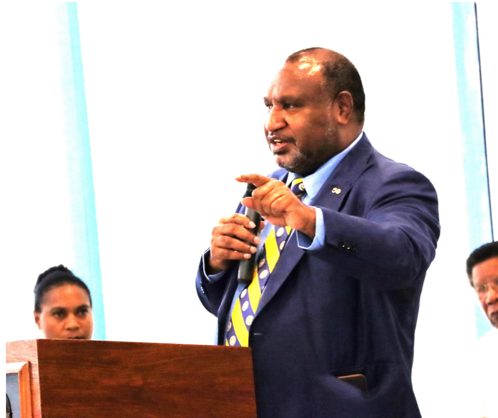
Prime Minister James Marape speaking at the NEC Dedication Service

The National Executive Council started the first meeting for 2025 with a dedication service facilitated by the National Executive Council Secretariat.