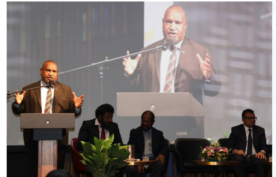
Prime Minister James Marape speaking at the FM100 NASFUND TalkBack Show

As part of Papua New Guinea's 50th anniversary reflections, the Prime Minister also highlighted the