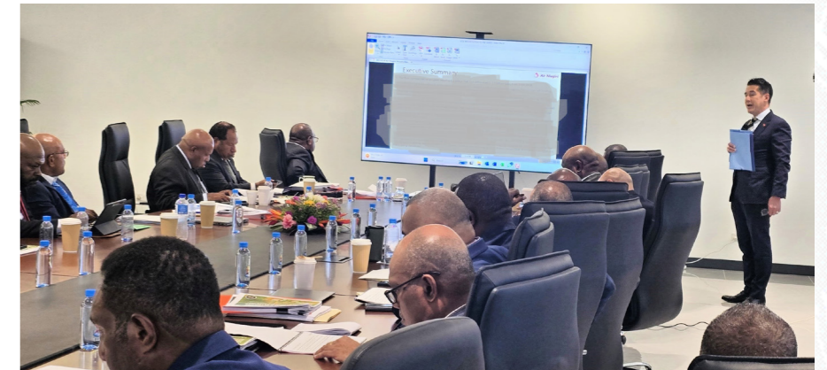
Air Niugini CEO Gary Seddon presenting a report for Air Niugini during a high level meeting with Prime Minister James Marape and Minister for State Enterprises William Duma

"The purchase of these aircraft is a significant milestone, reflecting our government's dedication to strengthening key national assets and enhancing connectivity for our people." The Prime Minister emphasised that Air Niugini's new fleet will enhance