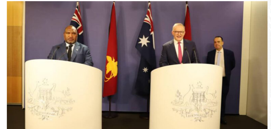
Prime Minister James Marape and his Australian Counter-part Anthony Albanese at a joint press conference. File pic

A key highlight of the discussion was Prime Minister Marape's invitation to the Governor-General to attend a special 50th-anniversary event in