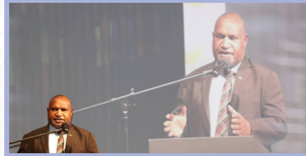
Prime Minister James Marape

Prime Minister James Marape has commended the National Superannuation Fund (Nasfund) for recording an unprecedented 34,450 new members in 2023, a direct reflection of job creation and economic growth in Papua New Guinea's private sector.