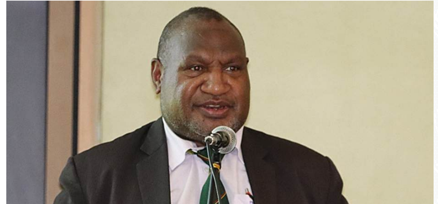
Prime Minister James Marape

Prime Minister James Marape has delivered a powerful and heartfelt address reaffirming his government's unwavering commitment to energy reform, economic transformation, and responsible leadership as Papua New Guinea approaches its 50th year of independence.