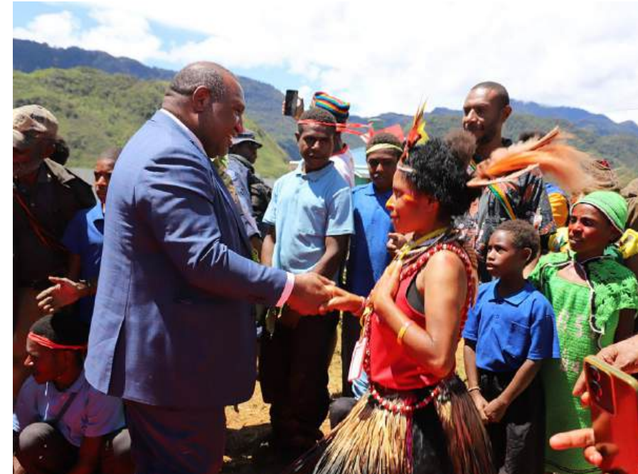
Prime Minister James Marape meeting school aged children in his electorate of Tari-Pori

Prime Minister James Marape has made an impassioned call on April 27, for young people in Papua New Guinea, especially in his own Tari-Pori District, to abandon tribal fighting and embrace education as the true pathway to lasting peace, prosperity, and nation-building.