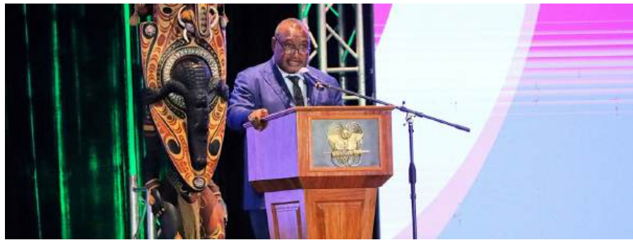
Prime Minister James Marape launches National Banking Corporation

Mr Marape highlighted the potential for the growth of NBC and commercial banks in PNG because of the expanding