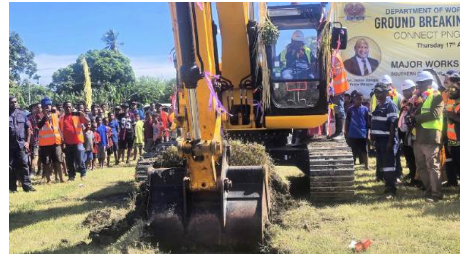
Prime Minister James Marape breaking ground for the Bereina to Malalaua road rehabilitation

Prime Minister James Marape led a ground-breaking ceremony at Bereina Station on April 17 to officially launch the major redevelopment of the Hiritano Highway, a key national infrastructure project that will link Port Moresby to Kerema and unlock the economic potential of Papua New Guinea's southern corridor.