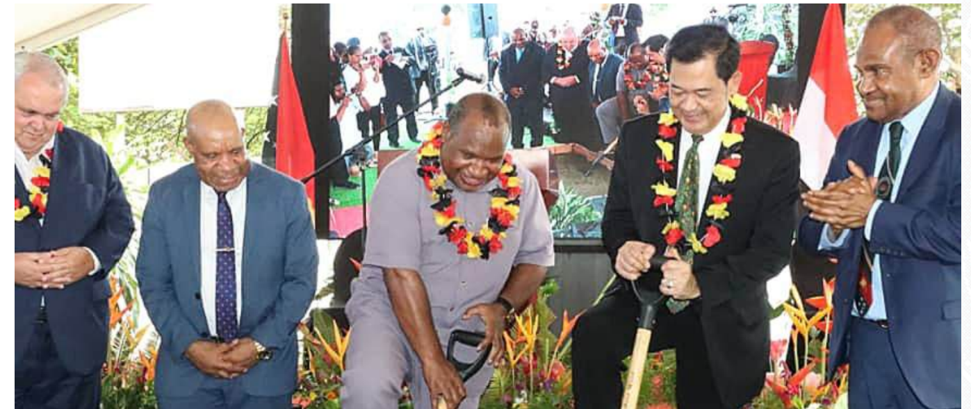
Ground breaking ceremony for the new Port Moresby General Hospital Mortuary

Prime Minister James Marape has thanked the Government and people of the Republic of Indonesia for funding the upgrading and renovation of Port Moresby General Hospital mortuary and Intensive Care Unit (ICU).