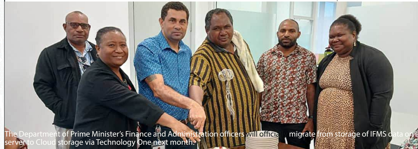
The Department of Prime Minister's Finance and Administration officers will officially migrate from storage of IFMS data on a server to Cloud storage via Technology One next month.