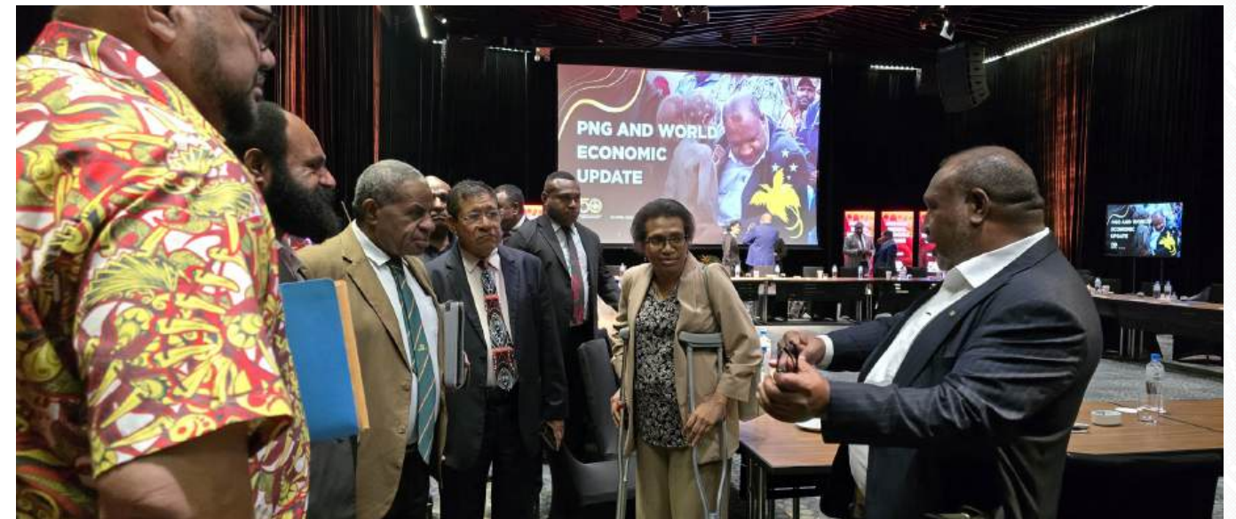
Prime Minister James Marape speaking to PANGU Pati Members after Economic update

Prime Minister James Marape led a high-level economic briefing on April 14 in Port Moresby ahead of vote-of-no-confidence on April 15, bringing together Cabinet ministers, governors, MPs, departmental heads, and international financial institutions to assess Papua New Guinea's economic outlook and guide national spending priorities.