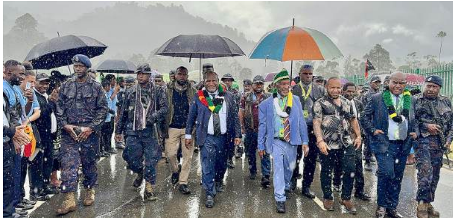
Prime Minister James Marape arriving in Wabag and accompanied by the Governor for Enga Sir Peter Ipata to the opening of the new Enga Provincial Hospital

The Enga Provincial Hospital features modern medical equipment, specialist wards, and capacity to operate as a Level 5 facility, with aspirations to evolve into Level 6 or Level 7 status — servicing not only Enga but also neighbouring provinces across the Highlands and Western regions.