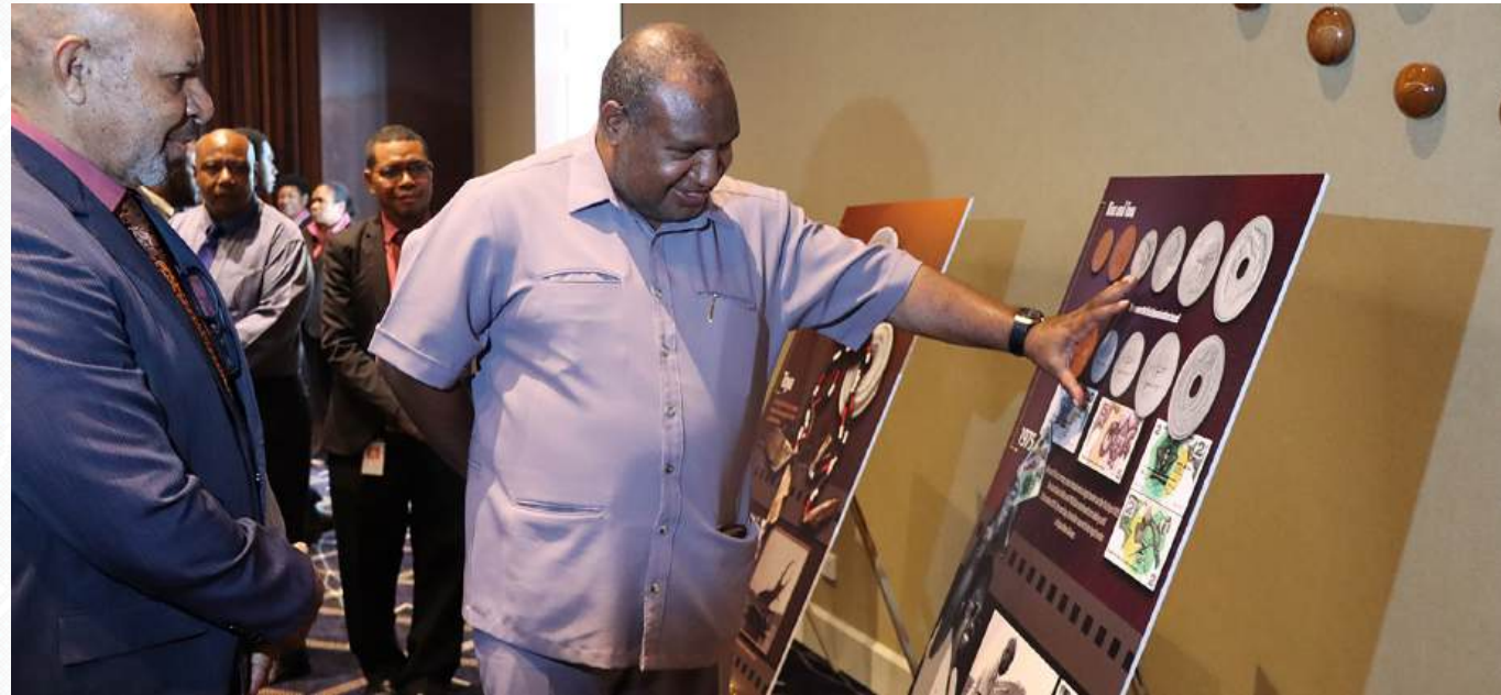
Prime Minister James Marape giving recognition to the Late Sir Julius Chan for naming the currency of Papua New Guinea

Prime Minister James Marape announced that Papua New Guinea will honour the late Sir Julius Chan, one of the nation's founding leaders, with the issuance of a new K100 banknote bearing his image — a historic tribute to a man regarded as the chief architect of PNG's financial system.