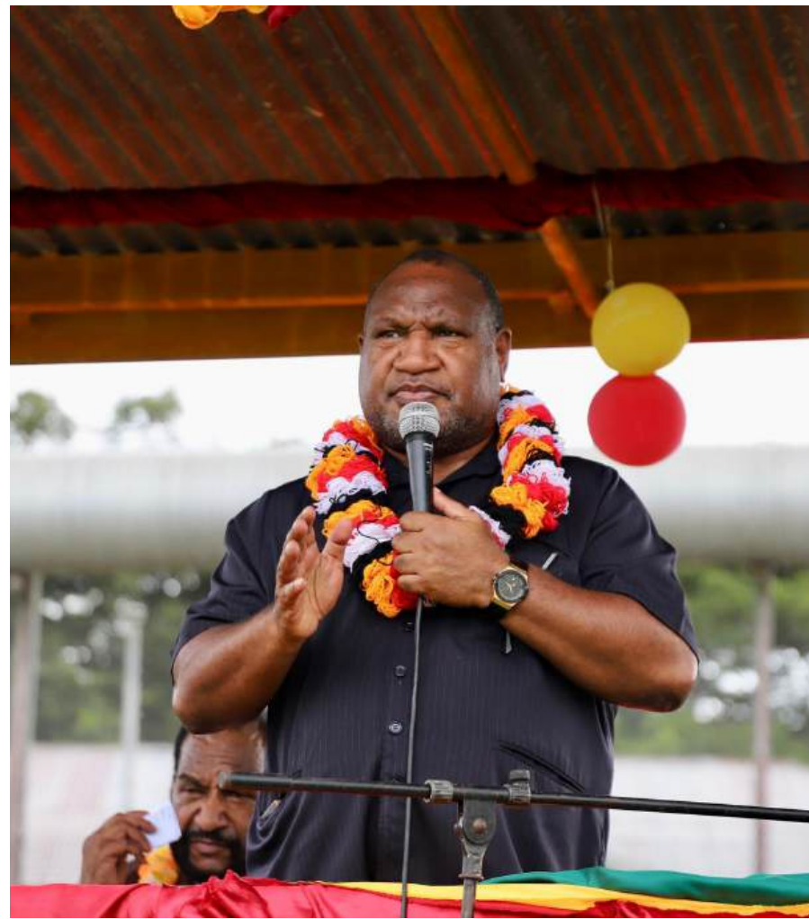
Prime Minister James Marape speaking at a domestic engagement in Enga province

"It is worrying to see first - and second-term MPs thinking they can ascend to leadership by calling for civil unrest, blocking roads, and inciting riots. I thank the people for not falling for these