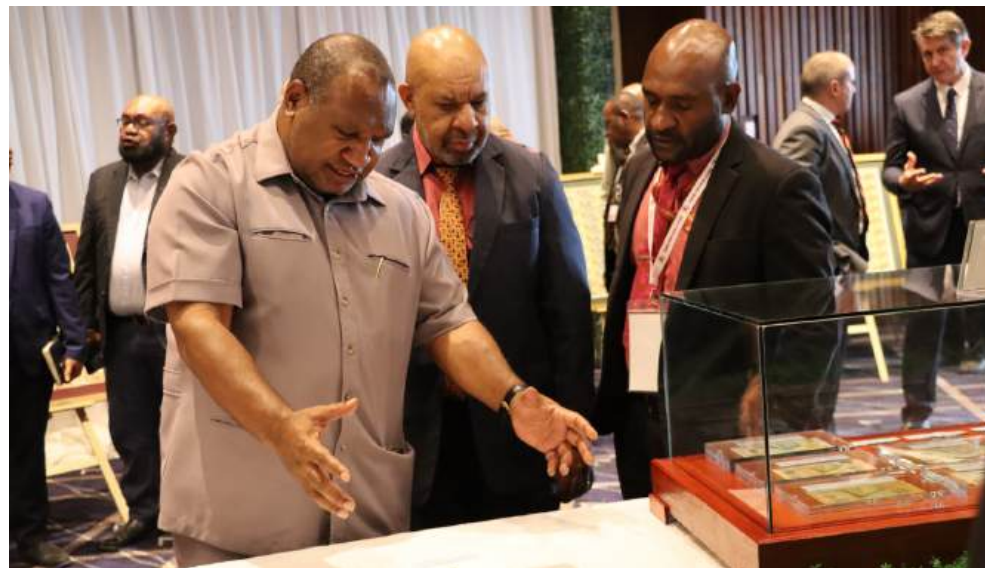
Prime Minister James Marape visiting BPNG displays of currencies to celebrate Kina and Toea Day

Prime Minister James Marape and Bank of Papua New Guinea (BPNG) Governor, Ms. Elizabeth Genia, officially launched the Commemorative Bank Note, Kina (K50), and Coin, Toea (50 toea) on April 28, to commemorate the 50th Anniversary of the Kina and Toea Day and the 50th Anniversary