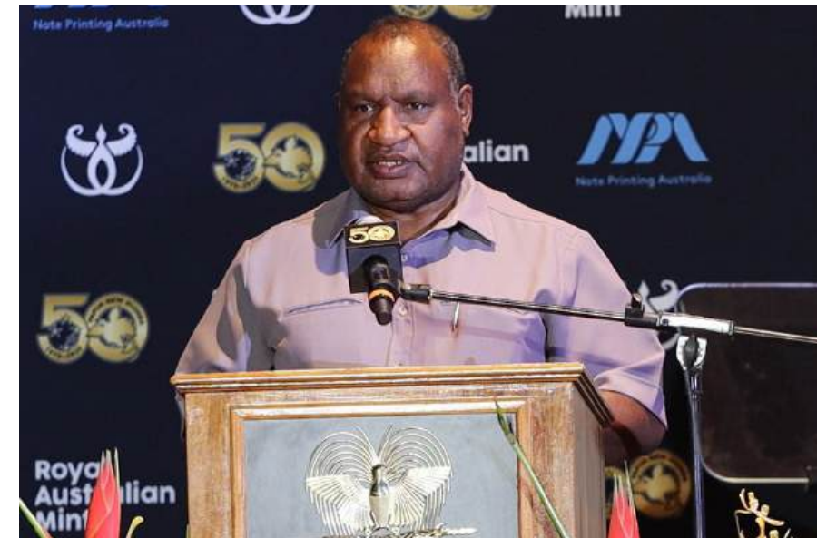
Prime Minister James Marape

Prime Minister James Marape has welcomed the findings of the Asian Development Bank's Asian Development Outlook (ADO), April 2025 report, which confirms that Papua New Guinea's economy is on a firm path toward recovery and resilience.