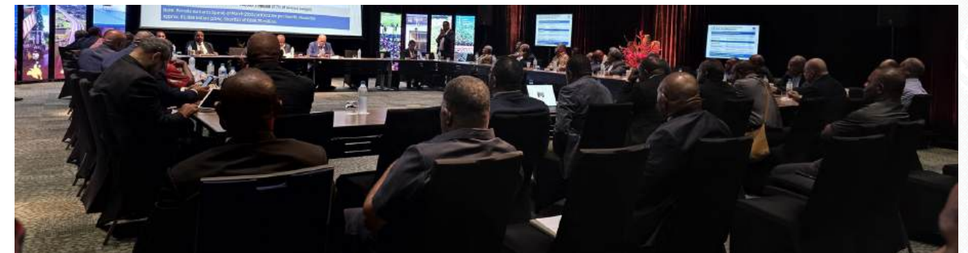
Government Cacao meeting with World Bank, IMF and ADB Country representatives for Papua New Guinea.

Papua New Guinea has received a significant vote of confidence from the international community following a high-level economic briefing that brought together the Government, key international financial institutions, and development partners.