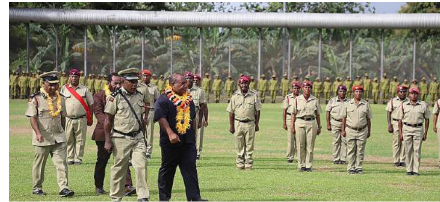
Prime Minister James Marape inspecting a guard of honour during his visit to the Bomana CS Facility in Port Moresby

In a significant gesture of compassion and commitment to rehabilitation, Prime Minister James Marape on April 21, made an Easter visit to the Bomana Correctional Services.