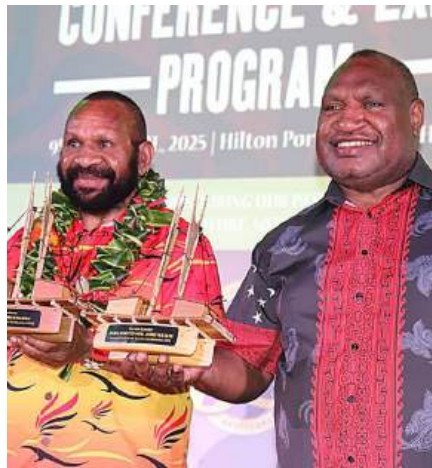
L-R: Minister for Tourism and Culture Belden Namah and Prime Minister James Marape

"We have many, many positives that outweigh the negativities in our country. All of us must be in total solidarity to make this country become a better place. In the midst of all the politics that is going on, we are still at work. I spoke at the opening of an Agriculture Conference in Lae earlier this week, encouraging that Agriculture