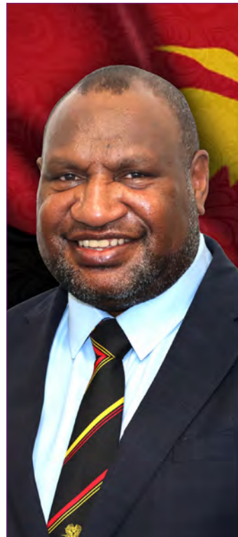
Prime Minister James Marape, MP (File Photo)

Prime Minister James Marape says the Independent Commission Against Corruption (ICAC) is now up and running, and urged the public to report all matters of corruption