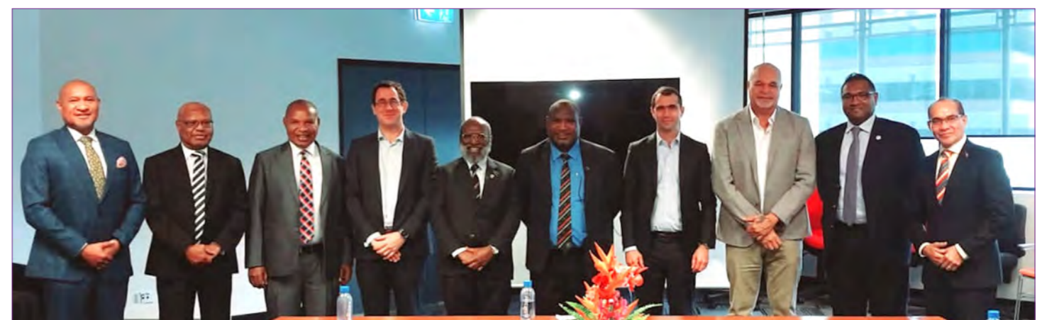
Prime Minister James Marape (5th from right), Deputy Prime Minister John Rosso (3rd from right) and Ministers at a high level meeting with TotalEnergies executives

Prime Minister James Marape and his senior Ministerial team have been briefed by Senior Executives of TotalEnergies that Papua LNG was on schedule for FEED ( Front End Engineering Design) announcement and will move into early preparatory works and as well as Final Investment Decision late this year or early next year.