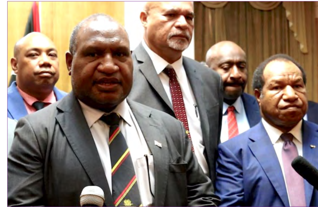
Prime Minister James Marape speaking at a press conference and accompanied by Deputy Prime John Rosso, Minister for State-owned Enterprises William Duma and Minister for Fisheries Jelta Wong