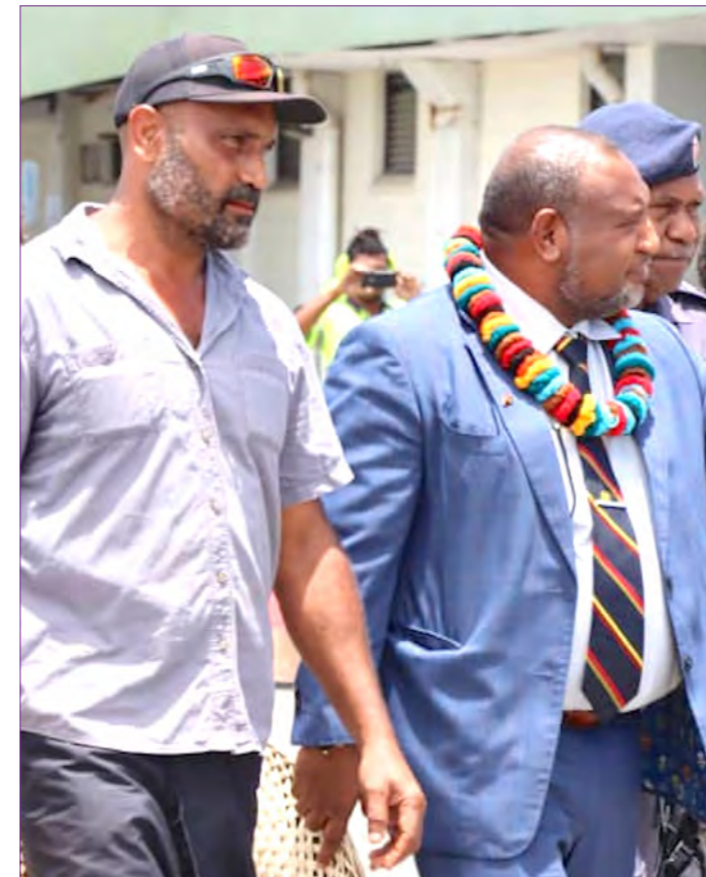
L-R: East New Britain Governor Michael Marum and Prime Minister James Marape at Tokua Airport, on their way to meet the people of Lassul-Baining

Prime Minister James Marape has assured people of remote Lasul-Baining in Gazelle, East New Britain, of better roads and communication.